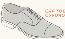
CAP TOE OXFORD