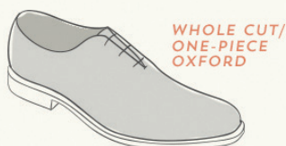
WHOLE CUT/ ONE-PIECE OXFORD