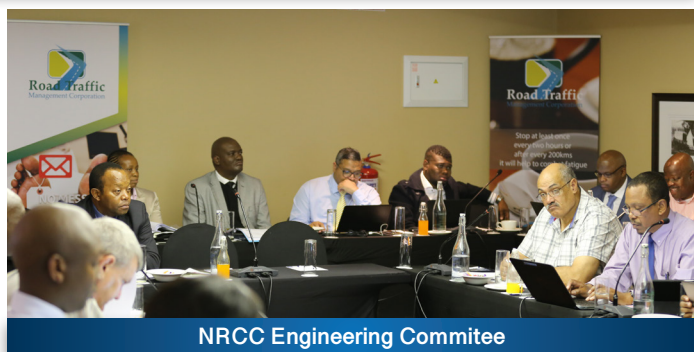
NRCC Engineering Committee