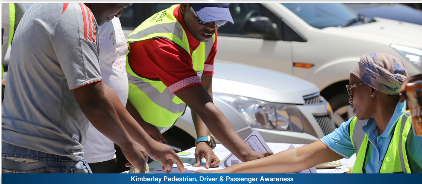
Kimberley Pedestrian, Driver & Passenger Awareness