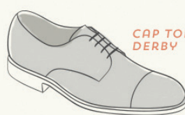
CAP TOE DERBY