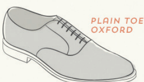
PLAIN TOE OXFORD