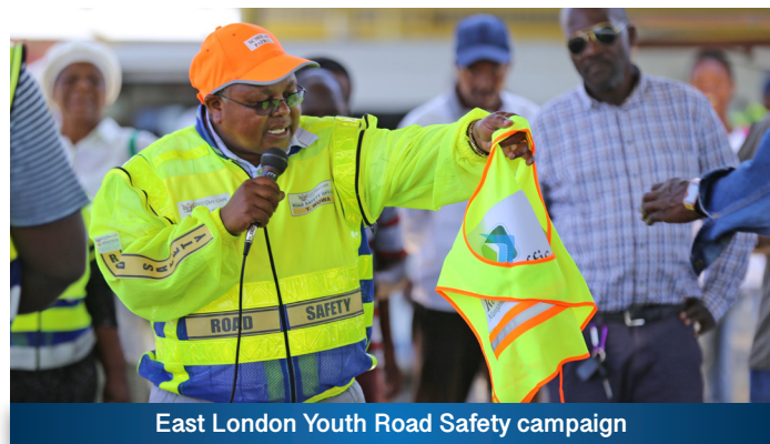
East London Youth Road Safety campaign