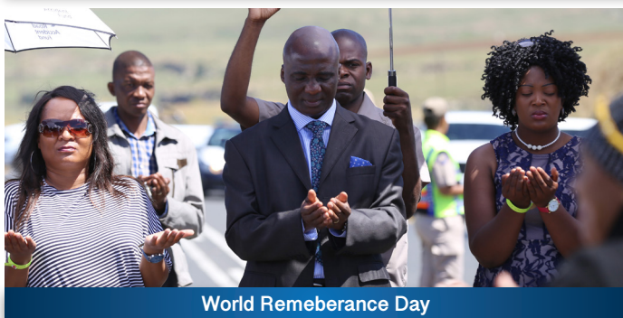
World Remembrance Day