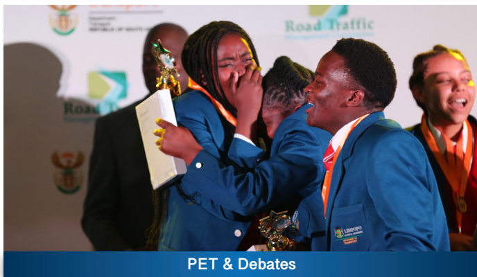
PET & Debates