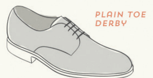
PLAIN TOE DERBY